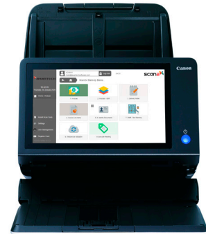
Scan2x on ScanFront