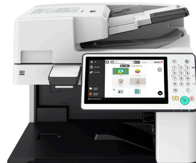
Scan2x on imageRUNNER