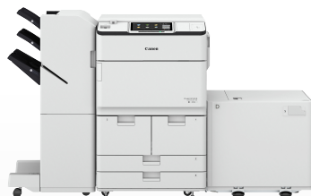
iR-ADV DX 8700

At the heart of this 'hybrid' working style is technology. Every organisation is undergoing a journey of digital transformation which will enable employees to work, connect and collaborate wherever they are.