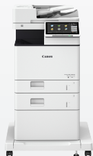
iR-ADV DX 717/617/527