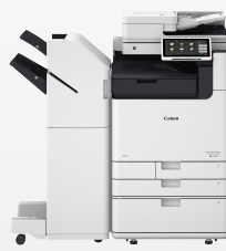
iR-ADV DX 6800