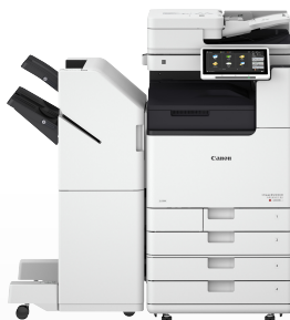
iR-ADV DX C3800