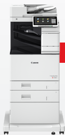
iR-ADV DX C478