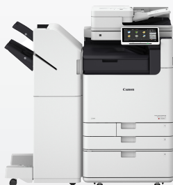
iR-ADV DX C5800