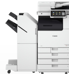
iR-ADV DX C3800