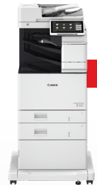
iR-ADV DX C478