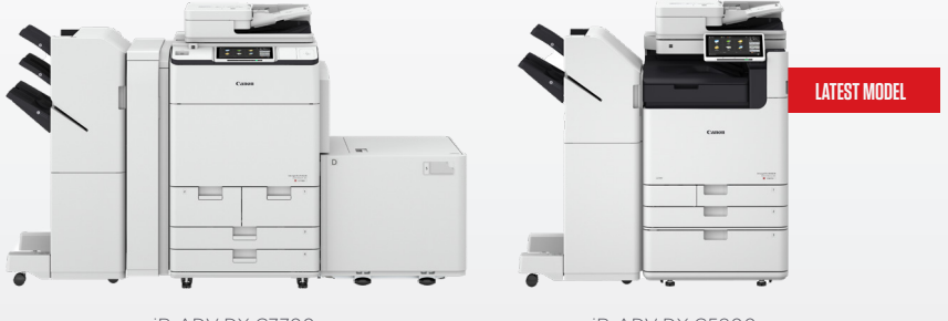
iR-ADV DX C7700