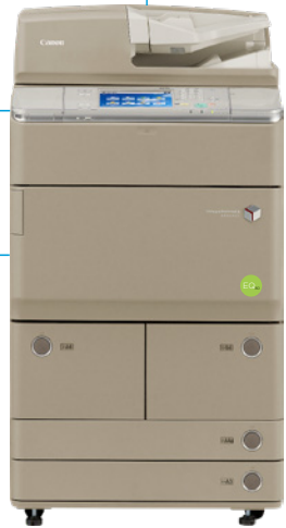
imageRUNNER ADVANCE EQ80 6275i (Duplex Color Image Reader Unit and Cassette Feeding Unit come as standard)