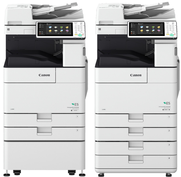
imageRUNNER ADVANCE 4525i ES II