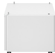
PLAIN PEDESTAL TYPE J-2