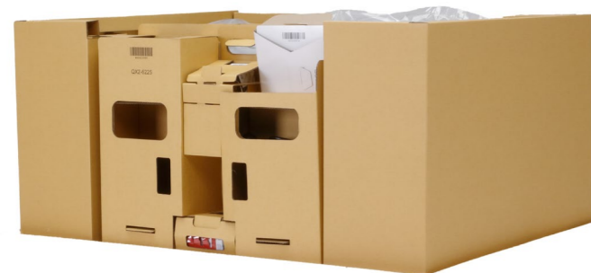
EPS-free packaging for TM, TX and TZ series 1