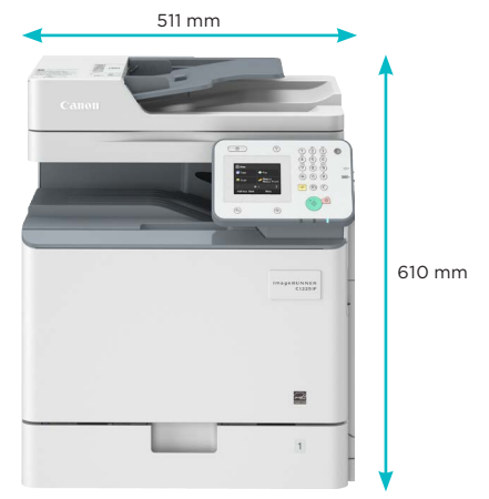
iRC1225iF 511 mm x 549 mm x 610 mm

All specifications subject to change without notice