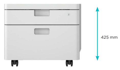
Cassette Feeding Unit-AJ1