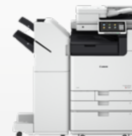
iR ADV DX C5800