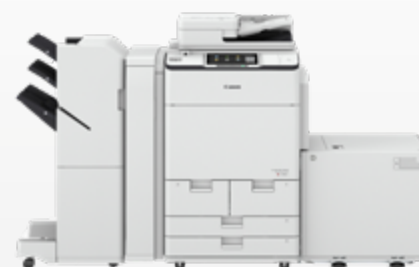
iR ADV DX C7780i