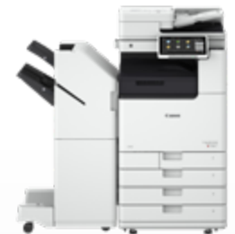
iR ADV DX C3800