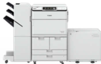
iR ADV DX 8700