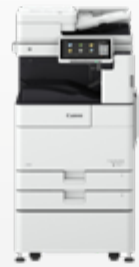
iR ADV DX 4700