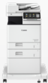
iR ADV DX 717/617/527