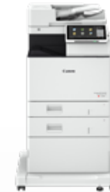
iR ADV DX C478i/iZ