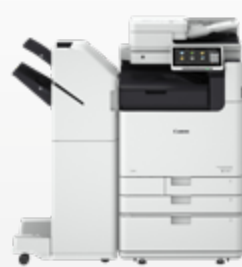
iR-ADV DX 6800