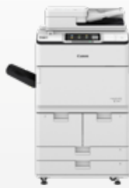
iR ADV DX 6780i