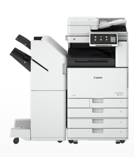
iR ADV DX C3700