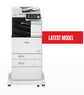
iR ADV DX C478