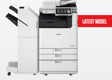
iR ADV DX C5800