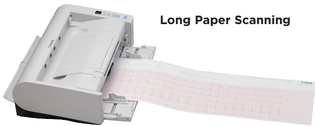
Long Paper Scanning