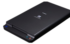
A4 Flatbed Scanner Unit 102