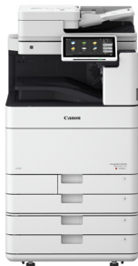
iR ADV DX C5700