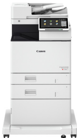
iR ADV DX C477