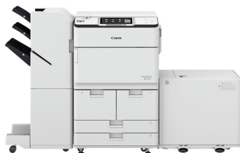
IR ADV DX 8700

For many businesses, progressing the digital agenda means operating in hybrid environments as automation and digital workflows realise efficiency, scale and collaborative workflows. In these environments, ensuring hardcopy and digital formats co-exist productively, balancing digital progress with complexity, cost and data protection, is key to success.