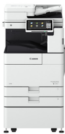
IR ADV DX 4700