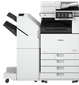
iR ADV DX C3700