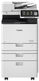
iR ADV DX C257/C357