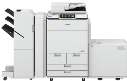
iR ADV DX C7700