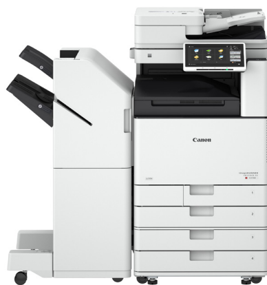
iR ADV DX C3700

This enables digital technology in keeping with modern organisational values, delivering and supporting maximum functionality while having a positive impact on the workplace's environmental footprint.