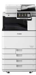
IR ADV DX 6000i