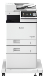
IR ADV DX 717/617/527