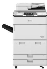
IR ADV DX 6700