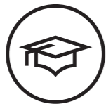
ADVANCED OPERATOR MAINTENANCE TRAINING