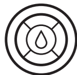
PROFESSIONAL PRINT - COLOUR MANAGEMENT AND TRAINING SERVICES