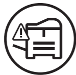
PROFESSIONAL PRINT DEVICE TRAINING SERVICES