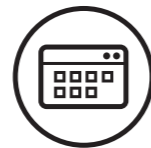
PROFESSIONAL PRINT SOFTWARE TRAINING SERVICES