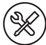
DEVICE MAINTENANCE AND SUPPORT