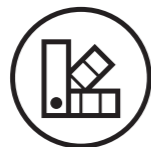
PROFESSIONAL PRINT - COLOUR CONSULTANCY SERVICES