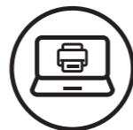
PRINTER CONTROLLER SUPPORT