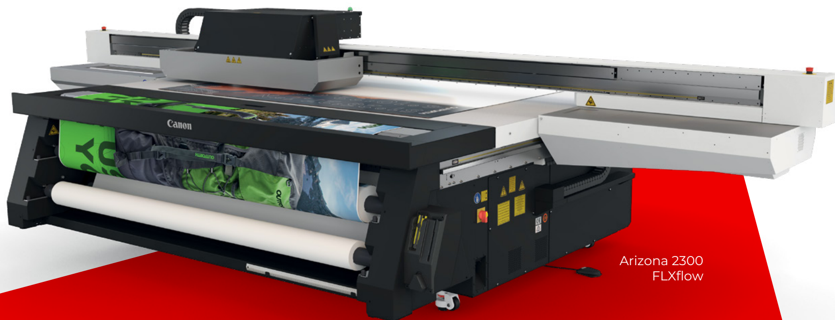
Arizona 2300 FLXflow

With a vast choice of printing speeds, table sizes, media handling capabilities and software options to cover all of your production needs, you can find the right Arizona flatbed printer that will deliver the creative applications your customers crave.