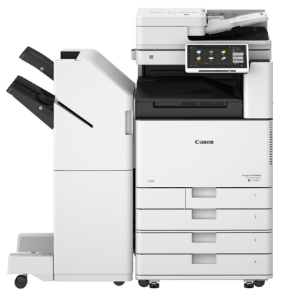
iR ADV DX C3700

This enables digital technology in keeping with modern organisational values, delivering and supporting maximum functionality while having a positive impact on the workplace's environmental footprint.