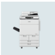
imageRUNNER ADVANCE DX C7780i