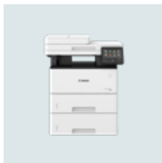
imageRUNNER 1643i Series 1643iF 43ppm 1643i 43ppm