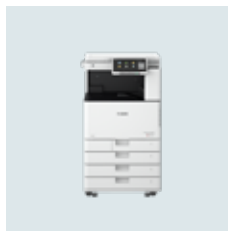
imageRUNNER ADVANCE DX C3800 Series