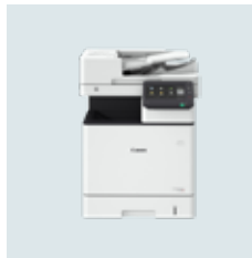
imageRUNNER C1530 Series C1538iF 38ppm C1533iF 33ppm