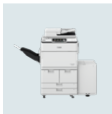
imageRUNNER ADVANCE DX 6780 & 6800 Series