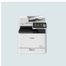
imageRUNNER ADVANCE DX C257/C357 Series