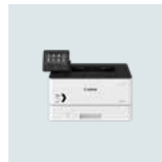
i-SENSYS X 1238P 1238P 38ppm