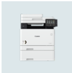
i-SENSYS X C1127i Series C1127iF 27ppm C1127i 27ppm