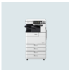
imageRUNNER ADVANCE DX 4700 Series