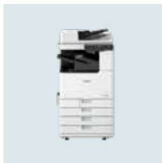
imageRUNNER C3226i Series