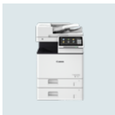
imageRUNNER ADVANCE DX 527/617/717 Series