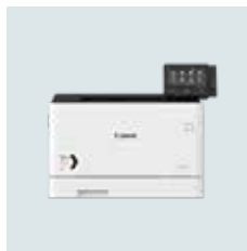
i-SENSYS X C1127P C1127P 27ppm