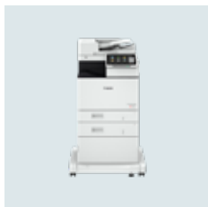
imageRUNNER ADVANCE DX C478 Series