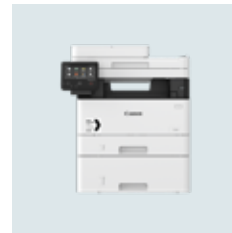
i-SENSYS X 1238i Series 1238iF 38ppm 1238i 38ppm