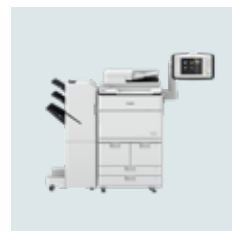
imageRUNNER ADVANCE DX 8700 Series