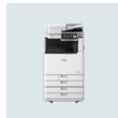
imageRUNNER ADVANCE DX C5800 Series