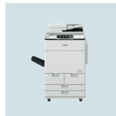
imageRUNNER ADVANCE DX C7700 Series