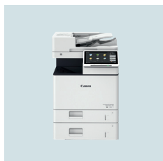
imageRUNNER ADVANCE DX 527/617/717 Series