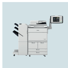
imageRUNNER ADVANCE DX 8700 Series