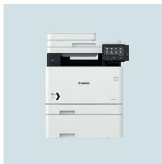
i-SENSYS X C1127i Series C1127iF 27ppm C1127i 27ppm