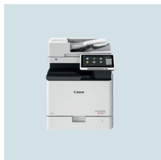
imageRUNNER ADVANCE DX C257/C357 Series