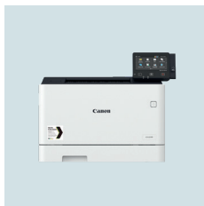
i-SENSYS X C1127P C1127P 27ppm