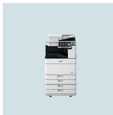
imageRUNNER ADVANCE DX C5700 Series