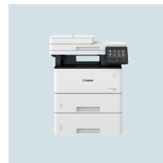
imageRUNNER 1643i Series 1643iF 43ppm 1643i 43ppm