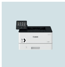
i-SENSYS X 1238P 1238P 38ppm