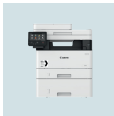
i-SENSYS X 1238i Series 1238iF 38ppm 1238i 38ppm