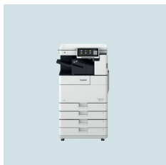
imageRUNNER ADVANCE DX C477i/iZ Series