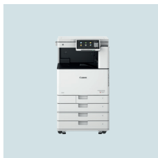
imageRUNNER ADVANCE DX C3700 Series