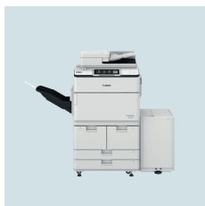
imageRUNNER ADVANCE DX 6700 Series