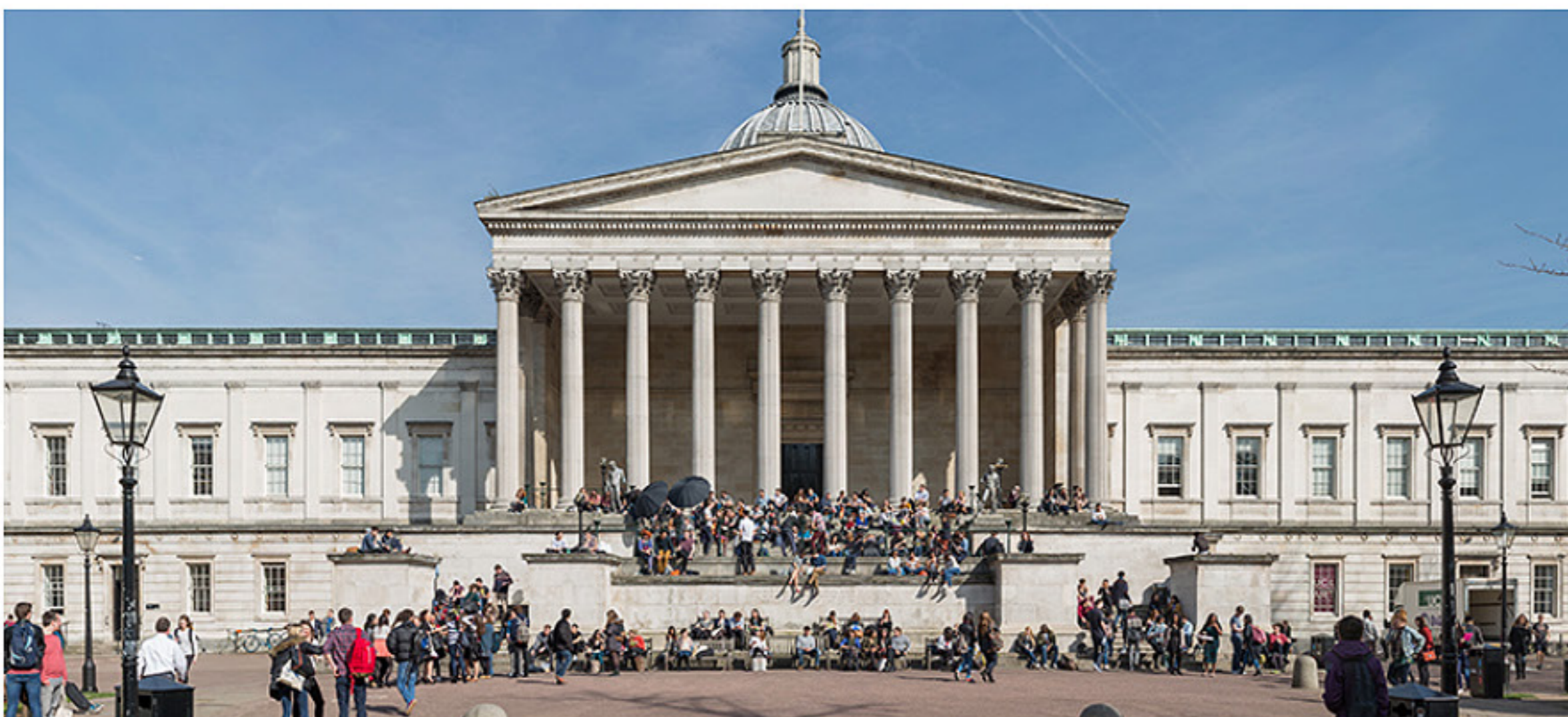
University College London.

After two years of not being able to hold a Fellow meeting due to Covid-19, we can look forward to this year's meeting which will bring together Alumni Fellows from the UK, Ireland, Denmark, Finland and Sweden and recently finished Fellows. The event will take place at University College London, UK on 24 June 2022.