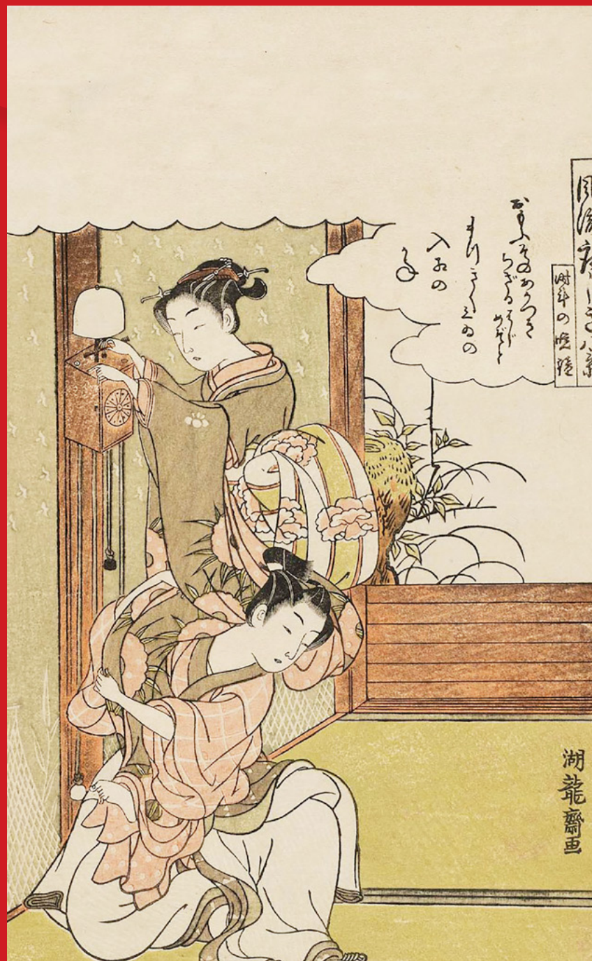
Evening Bell of the Clock (Tokeri no banshō), Isoda Koryusai, 1770.

For more information see: Timescapes Japan