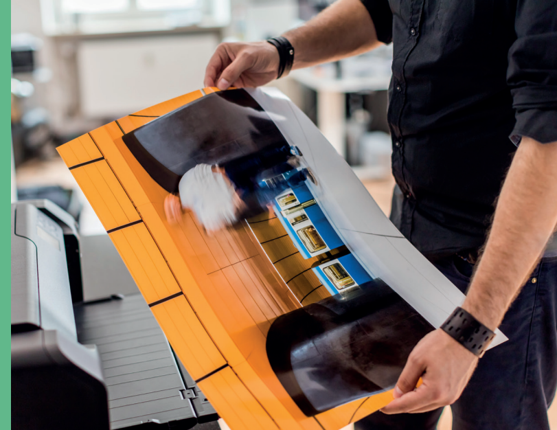
IMAGEPRESS C910 SERIES