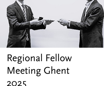
Regional Fellow Meeting Ghent 2025