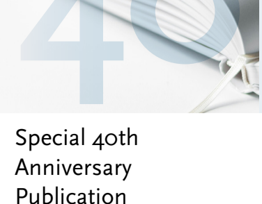
Special 40th Anniversary Publication