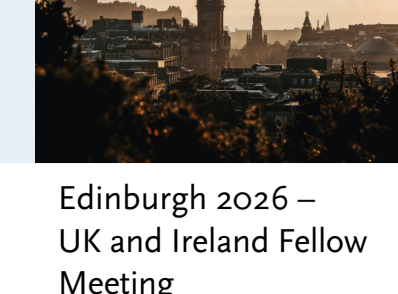
Edinburgh 2026 – UK and Ireland Fellow Meeting