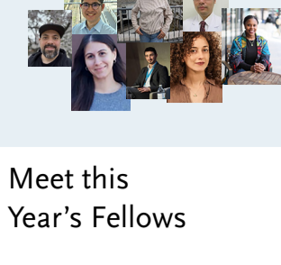
Meet this Year's Fellows