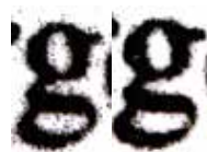
Conventional Printers VarioStream 4000

with easy connection to a wide range of inline finishing systems via industry-standard Type 1 interface