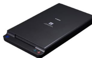
Flatbed Scanner Unit 102

Scan bound books, journals and fragile media by adding the Flatbed Scanner Unit 102 for documents up to A4 or Flatbed Scanner Unit 201 for A3 scanning. Connected by USB, these flatbed scanners work seamlessly with the DR-M260 in a smooth dual-scanning operation that lets you apply the same image enhancement features to any scan.