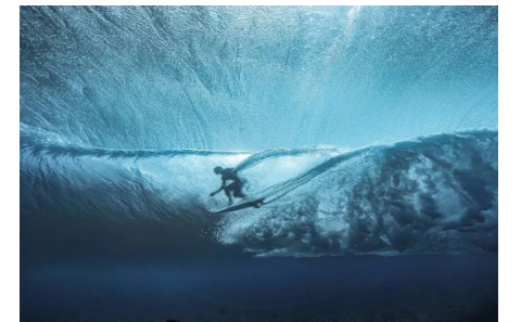
Let there be...Life