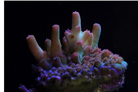
From commuter town to coral reef

Discover how our technology is used to inspire change with incredible stories from across the world.