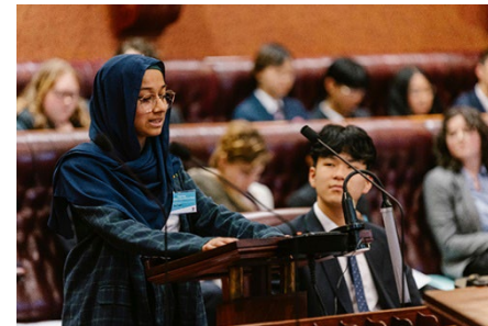
Canon Young Champion of the Year Award