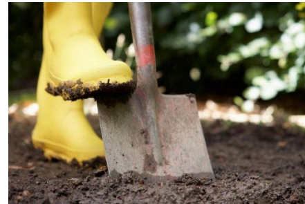
The Tiny Forests enchanting communities