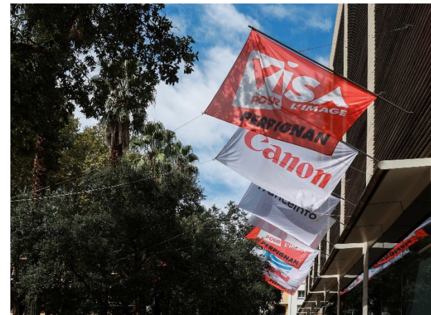
Visa pour l'image