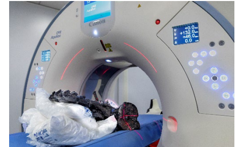
Uncovering the secret lives of dinosaurs