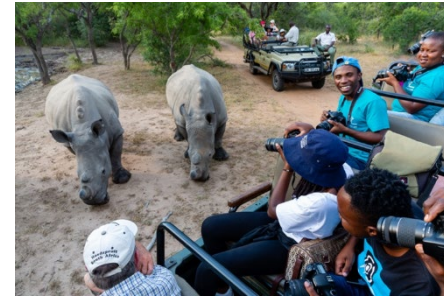
Young People Programme

We help to prepare people from a wide range of backgrounds across EMEA for the future by using our products, expertise and partnerships to empower them and help them grow.