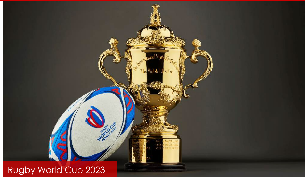
Rugby World Cup 2023