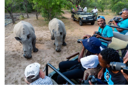
Young People Programme

We help to prepare people from a wide range of backgrounds across EMEA for the future by using our products, expertise and partnerships to empower them and help them grow.