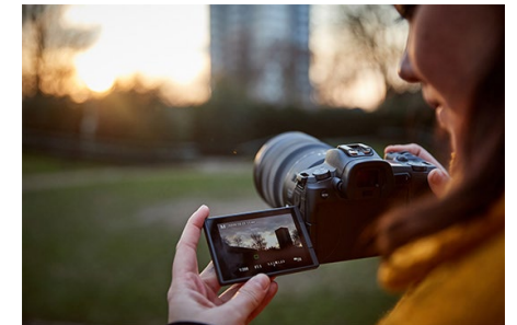
Student Development Programme