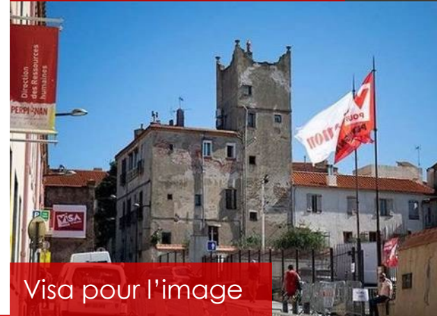
Visa pour l'image