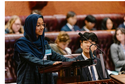
Canon Young Champion of the Year Award